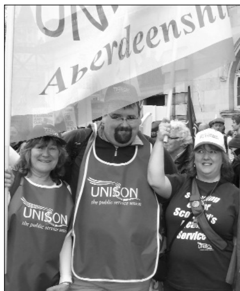
Demos can be fun! Smiling faces in London last year. Let's do it again in Glasgow!

"The Coalition Government may be in crisis but they are still refusing to change course from their dangerous and damaging programme of cuts and austerity. That damage is being directly translated into the Scottish Government's budget decisions,