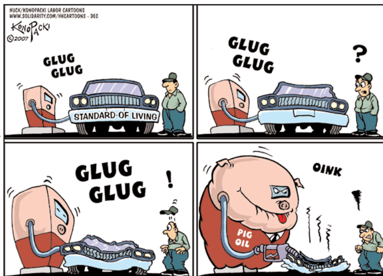
their views on how we deal with this issue.

The full text of the letter is on the UNISON Enable blog.