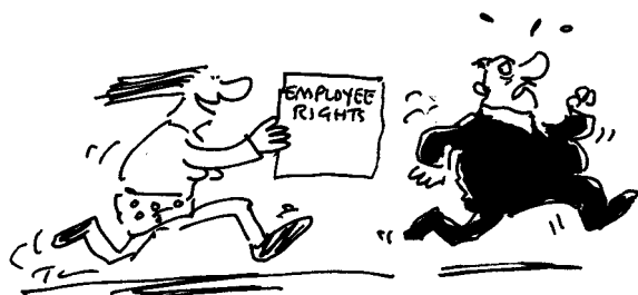
A CLEAR CASE OF HARASSMENT.

So when you need help, advice or protection you can rely on UNISON.