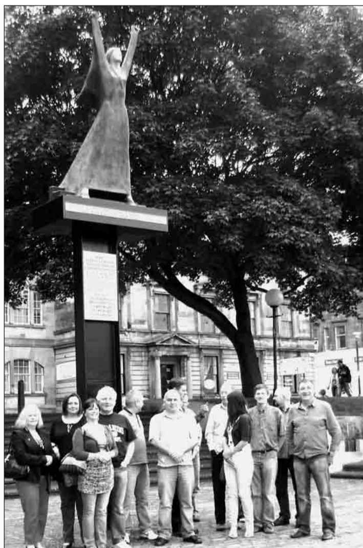
Course participants took time out to remind themselves of labour history with a visit to the Glasgow statue of Dolores Ibárruri or 'La Passonara', a memorial to those who fought against fascism in the Spanish Civil War.

It might also be suitable to run a shortened version for branches and we will be looking at that too. So watch this space and if anyone can think of a better name for the course we would be delighted to hear it!