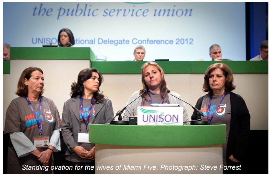
Standing ovation for the wives of Miami Five.