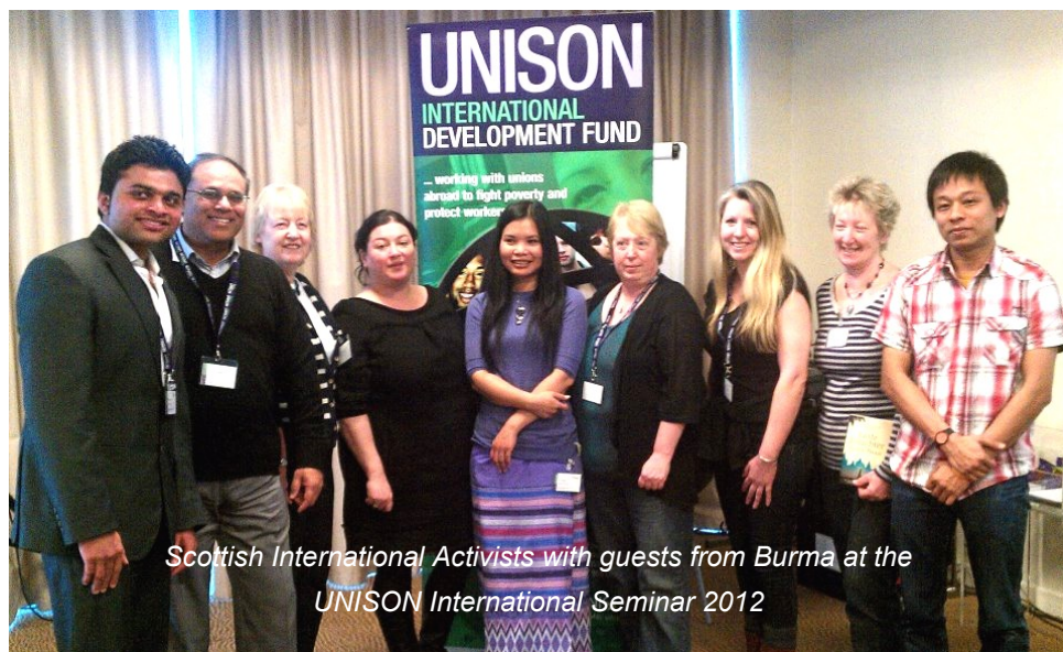
Scottish International Activists with guests from Burma at the UNISON International Seminar 2012

JfC campaigns for human and labour rights. They need your support.